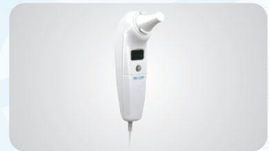
Infrared ear thermometer* 紅外線耳探體溫計*