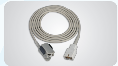
Pediatric Clip Sensor* 小童感應器*