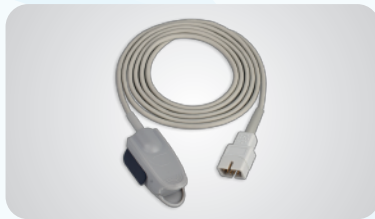
Adult Clip Sensor 成人感應器(標準配備)