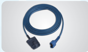
Adult Soft Sensor* 成人軟感應器*