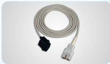
Pediatric Soft Sensor* 小童軟感應器*