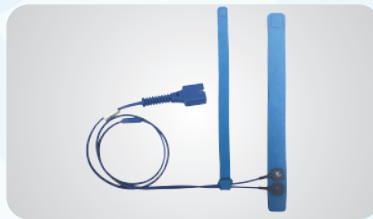
Neonate Wrap Sensor* 初生嬰兒軟貼感應器*